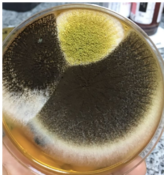
Fig. 1 Aspergillus growth in Sabouraud dextrose agar

After receiving the appropriate treatment for each case according to clinical and microbiological results, the success in outcome of treatment was defined as improvement in signs and symptoms and complete