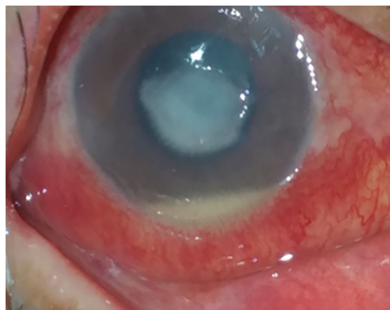
Fig. 2 Fungal keratitis caused by aspergillus flavus with hypopyon