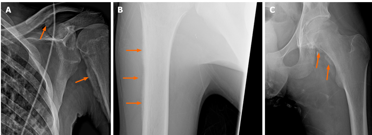
Figure 2 X-ray of bones showed evidence of skeletal fluorosis. A: Periosteal elevation (arrows) on the left clavicle and proximal left humerus; B: Fluffy periostitis (arrows) on the right humerus; and C: Periosteal reaction (arrows) on the proximal left femur.

We performed a comprehensive literature search in PubMed®, PubMed Central®, and Google Scholar®, using the words “fluconazole”, “itraconazole”, “voriconazole”, “posaconazole”, “isavuconazole”, in combination with “bone pain”, and “periostitis”. The search retrieved all articles identifying association of periostitis with voriconazole. We did not find articles of periostitis from other triazoles. We obtained and reviewed the full texts of all articles and collected data for analysis.