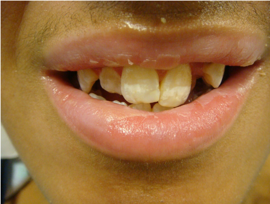
Figure 1 Whitish specks and discoloration, evidence of dental fluorosis, noted on the patient's teeth.